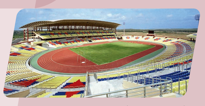
Hang Jebat Stadium, Melaka/Malaysia (MX system family)