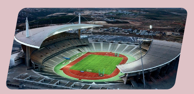
Atatürk Olympic Stadium, Istanbul/Turkey